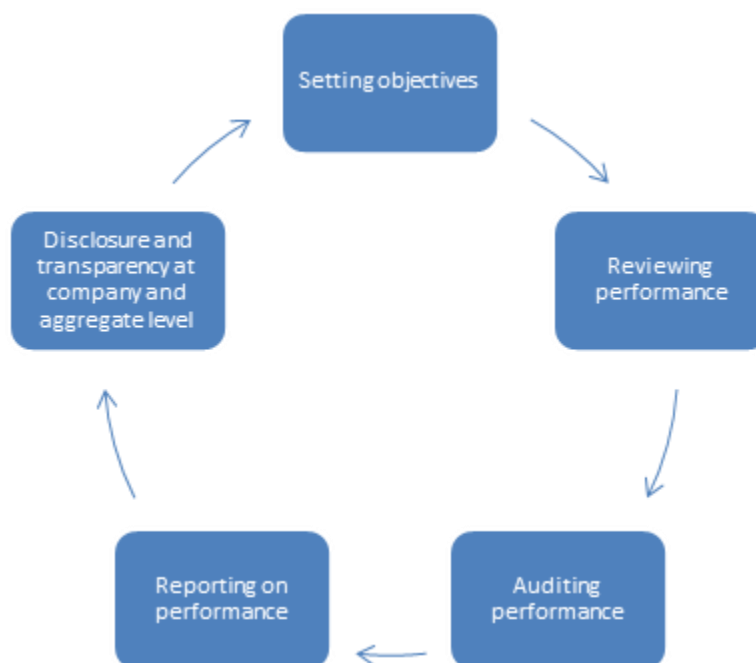
Figure 1. A “continuous improvement cycle”: The accountability and transparency guide

The OECD publication with the strongest direct bearing on performance monitoring, evaluation and reporting is, as mentioned above, the so-called Accountability and Transparency Guide ( Accountability and Transparency: A Guide for State Ownership , OECD, 2010a). Unlike the reports reviewed in the previous sections it is not a recommendation. Rather, it provides a stock-taking of commonly used national practices – basically in a step-by-step order – of the process by which ownership entities set objectives for their SOEs, review the performance of these enterprises, conduct auditing and other fact verification, and report about performance at the aggregate and company level. The process may be described as a continuous improvement cycle since, at the end of the process, the ownership entities are expected to use the information thus obtained to “return to square one” and set new objectives on a more informed basis (Figure 1).