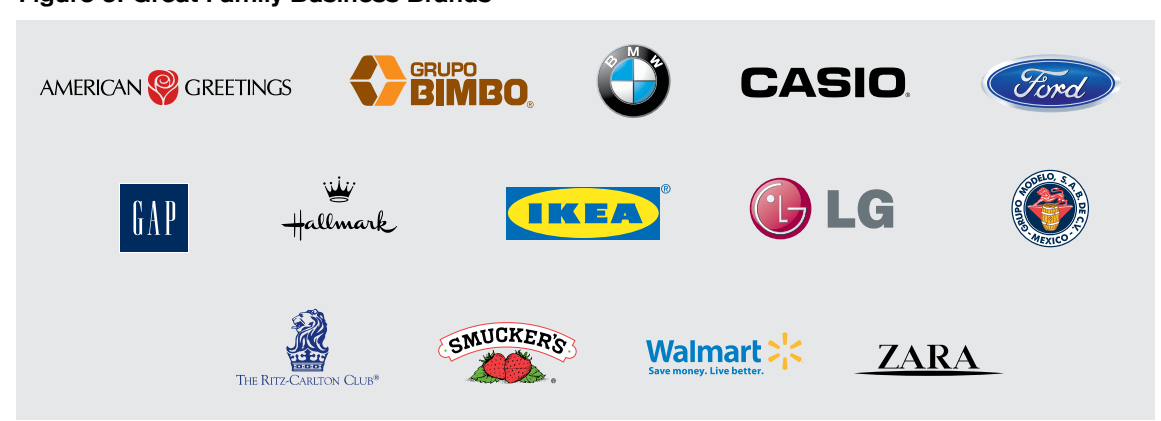
Figure 3. Great Family Business Brands

See Figure 3 for examples of great family business brands. These, along with premium names like Prada, Hermès, Salvatore Ferragamo, Grupo Femsa's Dos Equis, The New York Times, The Wall Street Journal, Copa Airlines and Bacardi, all highlight the significant potential that families have to build great reputations and continue the spirit of enterprise.